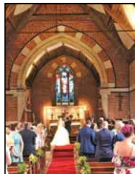
• All Saints, Pidley

Steeple Morden: new heating for gathering space at west end