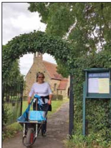
• RIGHT: The stone arriving at St Mary's

The message to cash-strapped PCCs must be to research your church's history, find an interesting anecdote, and devise an eye-catching or off-beat commemoration involving a bit of fairly strenuous activity which will encourage sponsors to reward the originality as well as the effort.