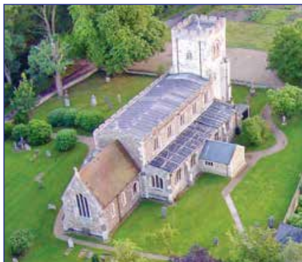
• St Mary's, Comberton, following lead theft