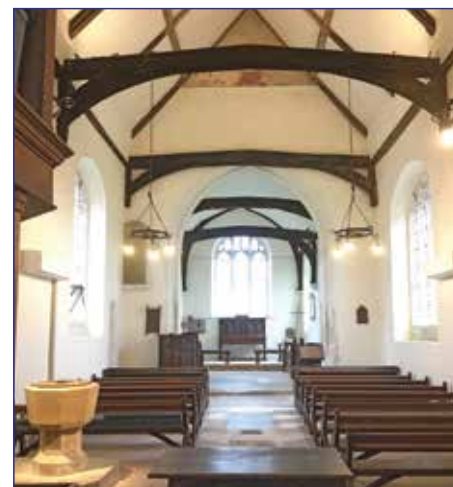
• St Mary's, Great Eversden, following structural repairs and moving of font (see page 4)

The Trust's total membership as at 30 June 2017 stood at 297 consisting of 190 individual members (of which there were 35 joint members at the same address) and 107 corporate or church members. This is a welcome, if modest, increase compared with 2015-2016. 11 individuals and 11 churches have joined the Trust since 1 July 2016. Seven individual members and one church resigned during the year. We were notified of one death and 5 members who were in arrears have been removed.