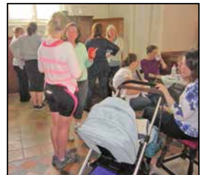
• St Peter & St Paul, Steeple Morden

The bare list of works hides a lot of imaginative engagement with the community and it was a privilege to endorse such good work. All being well the Engage awards will be offered again in 2018 so plan your application now! And thank you to everyone involved in the Trust in whatever way.