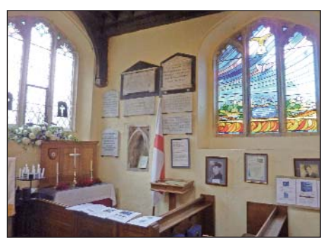
• The Pathfinder Memorial Chapel, Offord Cluny, commemorating members of the 35-635 Pathfinder Squadron based at nearby RAF Gravely. Visited by members in June 2011.

Each tour starts at 2.30 pm at the first church named. On arrival at the third and final church, our hosts are kind enough to provide us with tea, and toilets are available. Those who wish to can stay after the tour of the final church, for a short service of Evening Prayer, or join the congregation for their evening service if there is one. There is no charge for participation in these tours, which are open to all, but those attending are asked to donate generously to the churches visited, and especially for the teas. Directions will be posted on our website and printed in leaflets nearer the time of the tours.