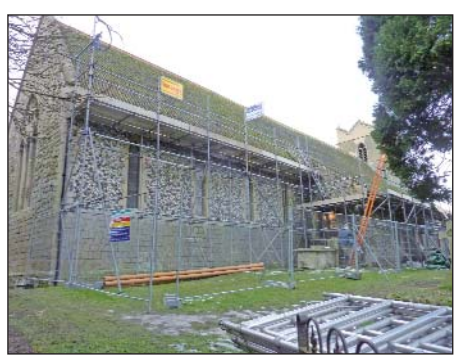
• Work begins at Horningsea, offered a £3,000 grant and £10,000 loan

Both www.churchcare.co.uk/funding and www.nationalchurchestrust.org/supportingyou/overview give information on other national grant giving trusts.