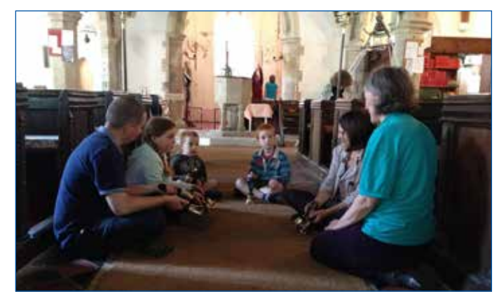
St Peter's, Horningsea – Heritage Open Day

This year's themes include Heritage & Nature and the 50th Anniversary of conservation areas.