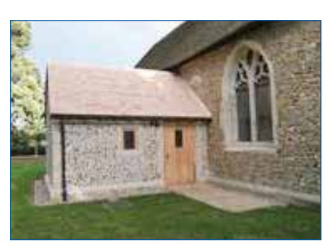
St Mary the Virgin, Great Abington exterior view

St Mary the Virgin Great Abington have also expressed their appreciation of our financial support - likewise a £20,000 loan and £3,000 grant - towards the cost of a new WC and servery.