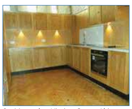
St Mary the Virgin, Great Abington-

either general repairs, or following lead thefts, or needed help towards alarms. Grants were awarded to Peterborough (St John the Baptist), Little Shelford, Abbots Ripton, Bourn and Buckworth, and a loan made to Oakington.