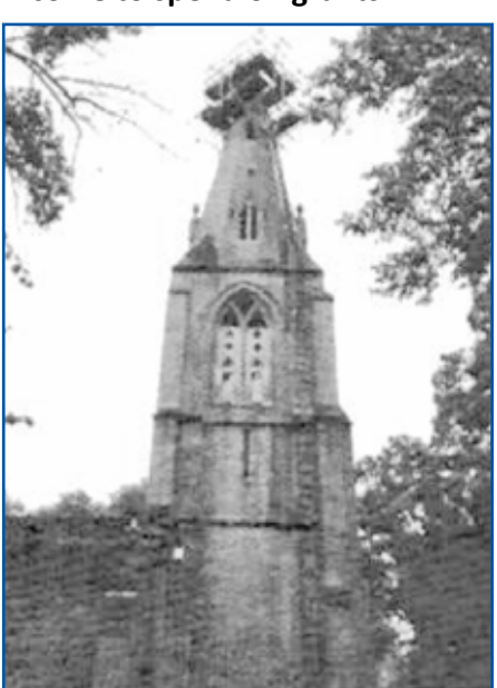
Mary's Bainton Spire Repairs

It's always good to hear news about projects completed with our help. Since our Autumn newsletter came out St Mary's Bainton have told us about the repairs to their spire for which we awarded a loan of £20,000 and a grant of £3.000. It was especially interesting to learn of the efforts over many years by one of their now deceased parishioners in support of the Ride, Drive and Stride, which they recognise as being the Trust's main source of income to spend on grants.