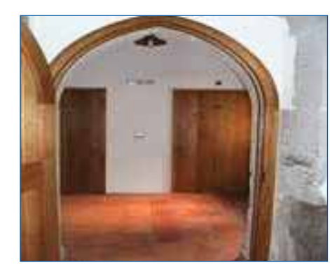
St Mary the Virgin Great Abington -Interior

The focus of recent meetings has been on fabric repairs. Many applicants have had roof problems,