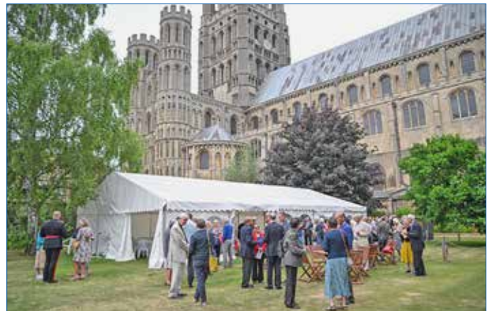
• Garden Party for CHCT@40