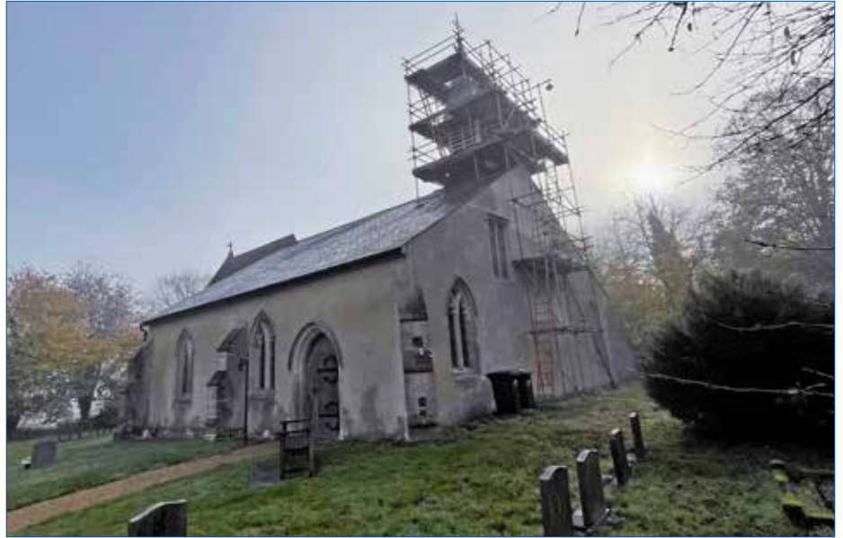
• Westley Waterless Scaffolding

extensive decay in the principal posts of the turret.