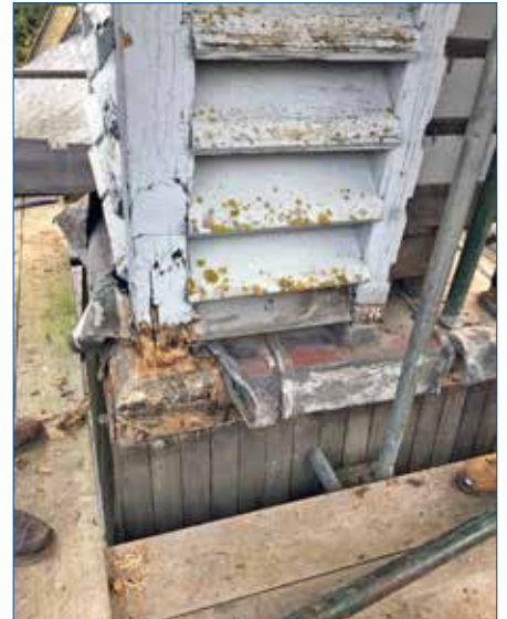
• Westley Waterless during the work