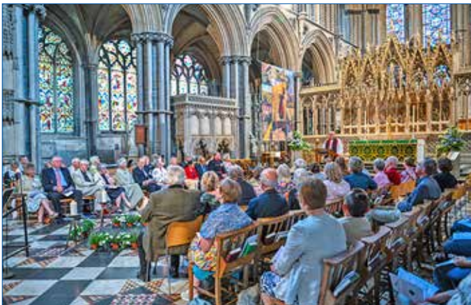
• Festal Evensong to celebrate CHCT@40