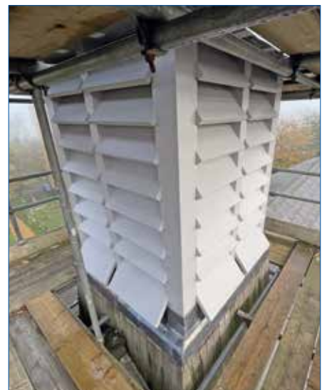
• Westley Waterless after