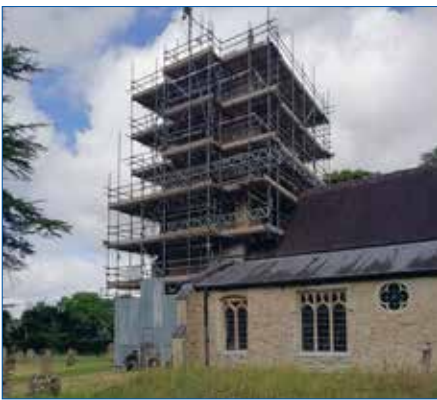
• Stetchworth St. Peter.

Almost all of the applications were for small projects, (stone and roof repairs), related to earlier Quinquennial Inspections, (QI's). One of these was at Stetchworth, St Peter where the tower is now fully scaffolded. (See one photo attached).