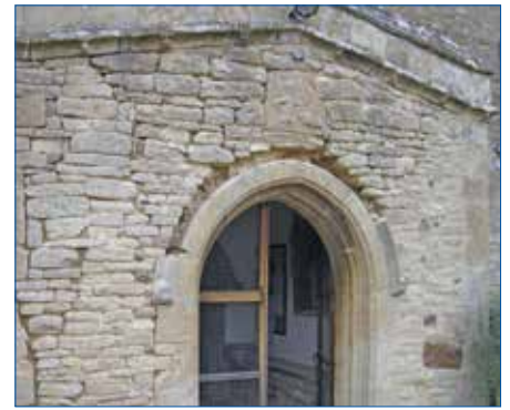
• All Saints, Tilbrook, porch before and after

Less glamorous, but equally important was the now completed external stonework repairs to All Saints, Tilbrook , also from our 2022 to 2023 funding. (See 2 photos attached.)