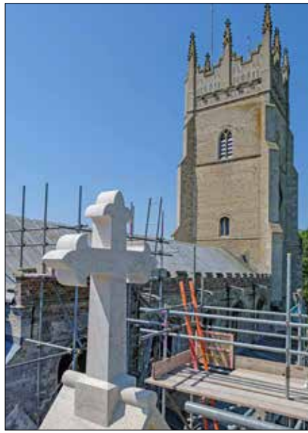
• St. Andrew's, Soham.

We would like to think that an early CHCT offer of grant and loan back in 2022 to 2023 helped St Andrew's, Soham to secure their Lottery Bid. (See two photos attached). This was a project with building works costing around £200,000 but they had to spend another £100,000 on "Heritage Engagement Activities" in order to secure the Lottery funding. Soham