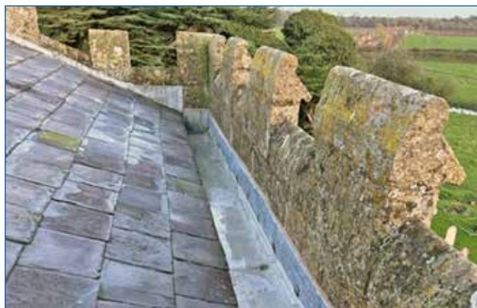
• Marholm, St Mary the Virgin, new Chancel gutter