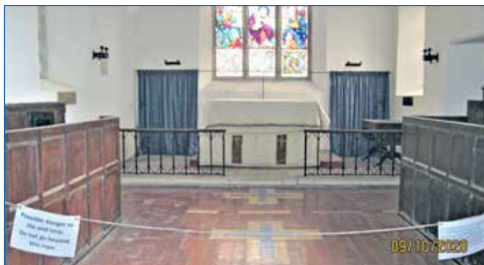
• Croydon, All Saints, Chancel.

Also delayed has been any work at Croydon, All Saints. It has been known for some time about the weak Chancel floor, (see photo), and the South arcade which is being racked by seasonal ground movement. Before going