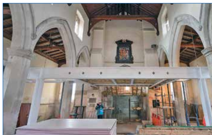
• Bassingbourn, St Peter & St Paul, from East

In the Autumn 2024 Newsletter, I wrote about the new Lottery Grant and expressed hope that this would be easier than the old scheme to get funding for churches. One of the early beneficiaries of the new Lottery scheme has been Cambridge, St Giles, (also known as St John the Evangelist for the Romanians); they have received a generous sum of £216,000 to tackle high level gutters and windows. Scaffolding has now gone up and can now be seen from Castle Street. (See photo). Unfortunately, however, the Government Grant Scheme for claiming back VAT is now restricted and for this coming year, (until 31st March 2026), churches can only claim back £25,000 worth of VAT . There is also a national limit restricted to £23 million. With a likely VAT bill of £50,000, St Giles are now faced with an additional cost of at least £20,000.