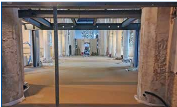
• Bassingbourn, St Peter & St Paul, from West

The re-roofing project at Morborne, All Saints will also now become a lot more expensive with the new VAT grant restrictions. CHCT had offered a grant back in 2021 for reroofing just the north slopes but the PCC could not raise the funds at that time and have now been advised to approach the Lottery with one large project. The collyweston slates are impossible to patch (repair and the roof has been leaking for at least five years. (See photo).