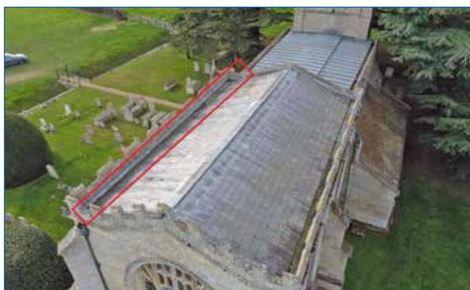
• Marholm, St Mary the Virgin, gutters before

We have one grants meeting still to go this year, but have already offered some £30,500 in grants and £70,000 in interest free loans. As always, you can read about the full list of our grants and loans at https://camhct.uk/grants/