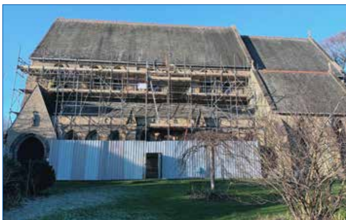
• Cambridge, St Giles, S Scaffolding