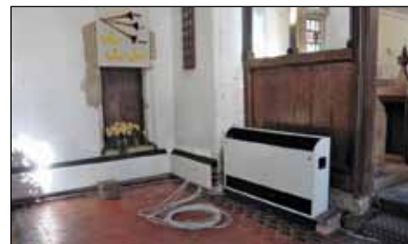
• The new heating going in at Meldreth, with a CHCT grant of £1000 and loan of up to £10000.