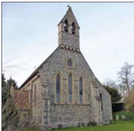
• The RC church of Our Lady Immaculate and St Philip Neri at Kirtling received a £2000 grant for the repair and protection of the west window glazing.