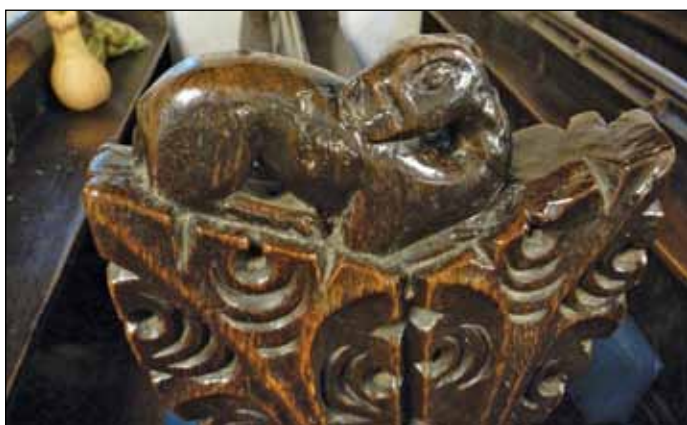
• A C15th pew end at Eynesbury, where CHCT offered a grant of £1000 towards their quinquennial repairs.

The trust is an independent Charity with a primary task to support the repair and restoration of places of Christian worship in Cambridgeshire. Its funds accrue from the annual sponsored cycle ride and are used to make grants and interest-free loans to churches.