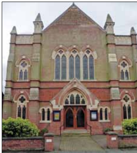
• Ely Methodist Church. The Trust gave a grant of £1000 towards the renovation of this facade facing Chapel Street.

Sunday 9th August Graveley St Botolph, Papworth Everard St Peter, Eltisley St Pandionia and St John the Baptist.