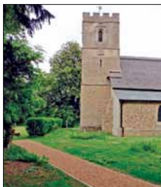
• The new path at Rampton for which the Trust offered a grant of £1000 and loan of up to £20000.