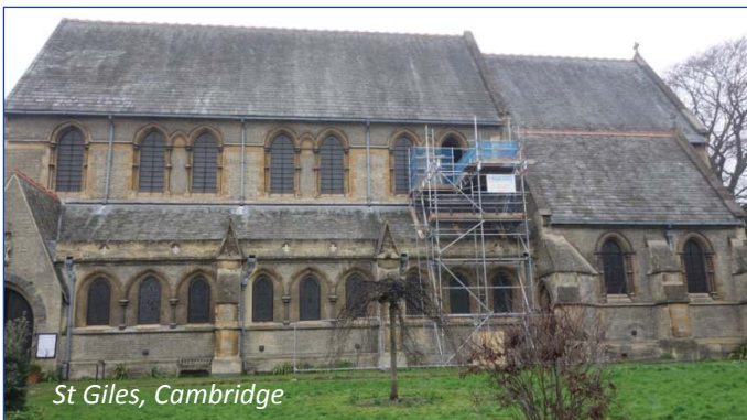
St Giles, Cambridge

Even with the Covid lockdown, applications for grants and loans have been coming in at an increasing rate. In some cases, the driver has been the award of Historic England's Emergency Heritage at Risk Grants up to £25,000 for projects costing no more than £30,000. By tackling the most urgent works first, it makes sense, particularly with the contractor on site or scaffolding still in place, to then go further with the help of other grant giving bodies. This is being done successfully, not only at All Saints, Croydon and St Mary, Whaddon, (reported in the last Newsletter), but now at St Giles Cambridge and St Peter, Carlton. St Giles has some 50 windows to maintain and were able to plan discrete packages of work.