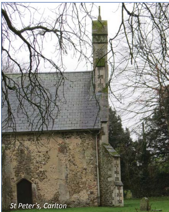
St Peter's, Carlton

St Peter's was not so fortunate; it knew that urgent repair was needed to the nave/chancel arch but had only planned to put scaffold up at the west end to investigate structural movement there. On close inspection, urgent works to stabilise the west wall have been identified and they are now proceeding with one of our grants.