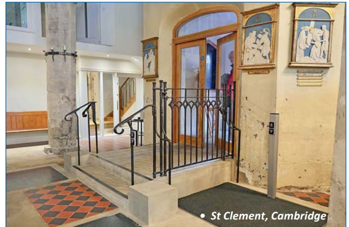
• St Clement, Cambridge

In the last Newsletter, I reported on the near completion of work at St Clement's, Cambridge on Bridge Street and I know some of you have been to see it already. This further photo shows the final completion of Phase 1, so do go along you wheel chair users and try the lift out for yourselves.