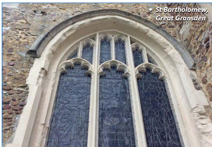
• St Bartholomew, Great Gransden

Repointing the tower is being planned for St Andrew, Great Staughton and a grant of £3,000 along with a loan of £20,000 has been awarded to help start their fund raising. Masonry repairs have now been completed at St Bartholomew, Great Gransden (see photo) and also St Mary, Bartlow (see photo); I do hope that you agree with me that both repairs look rather splendid now.