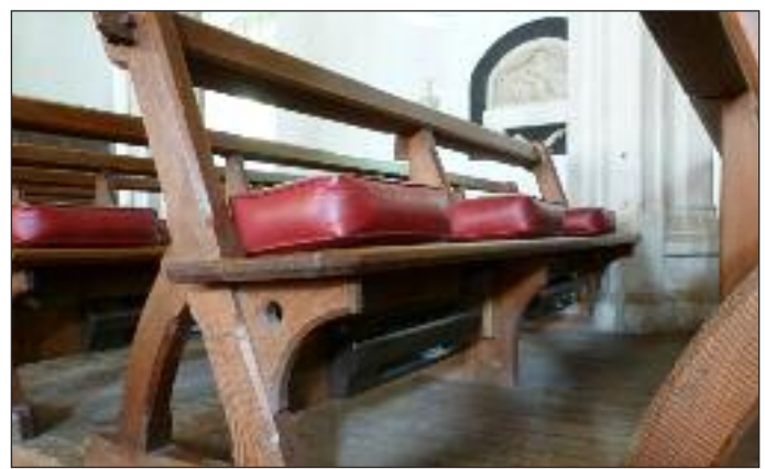
• Stetchworth, St. Peter. Our grant of £3000 meant that this small parish could re-wire and install some badly needed under bench heating.

As at 30 June 2013, member-ship stood at 273 made up of 197 individual (including 38 joint members at the same address) and 76 corporate members. Since July 2012, we have welcomed 5 new individuals and 10 churches. These figures have been offset by 11 resignations and the removal from the database of about 14 members who have been in arrears for two years or more.