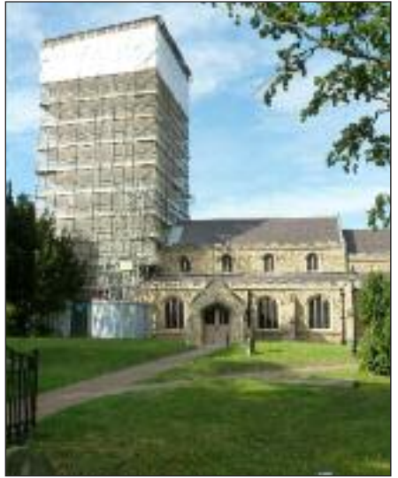
• Littleport, St George: The Trust's £3000 grant and £15,000 loan might seem a small contribution to this \pounds 250,000+ tower repair, but it was a third of the shortfall required by the parish to match the English Heritage grant.

However, we could not have done what we have in 2012-13 without the enormous effort put in by the members of the Executive Committee and I thank them, on behalf of all the Trustees and members of CHCT, for all they have done over the last twelve months.