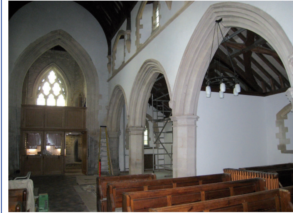
* Work in progress at Stretham

CHCT has paid out well over half a million pounds in WREN and CHCT grants in the 10 years since the inception of the WREN scheme. Adding the offers yet to be taken up nudges the figure to almost £600,000.