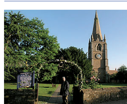
· Ely, Church of St Mary

Each tour begins at the first church at 2.30pm and ends with tea and evensong at the last church