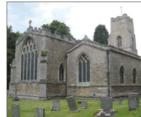
• Holy Trinity, Orton Longueville. The Trust offered a loan of £20,000 and a grant of £5,000 towards an extension for new facilities being added to the north of this Grade 1 church.

In effect, our available funding for grants has more than halved. In each of the last four years, we have given an average of £56300 in grants, equally split between WREN and CHCT. In addition, WREN has given us awards from their Gift-aid fund totalling nearly £34000 since 2006. We are told 'WREN would still like to be able to support Churches and we are looking for ways of being able to provide funding under a new program (sic)...but it is unlikely there will be any firm news before June 2010'. Trustees expect to have awarded the entire WREN monies by June, so we have decided to use all last year's income for CHCT grants in 2010/11 (rather than increase the money for loans). Most of our annual income comes from the annual Ride and Stride event in September and so we will be putting extra effort into it this year (see page 4).