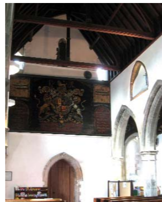
• CHCT offered a loan of £12,000 and a WREN grant of £5,000 towards a new toilet at St Leonard, Little Downham.