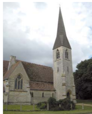
• St James the Great, Waresley. A grant of £1,000 enabled the bell installation project to be completed after costs rose.