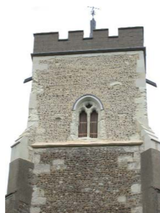
• The work at the top of the tower of St Mary's Great Eversden was helped with a WREN grant of £7,000

• RIGHT: A WREN grant of £6,000 was spent on new stonework and a lead roof at St Peter, Horningsea.